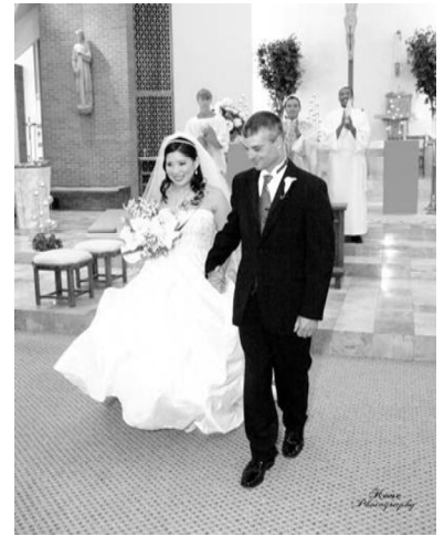
The wedding ceremony took place at St. Ann's Catholic Church in Midland, Texas