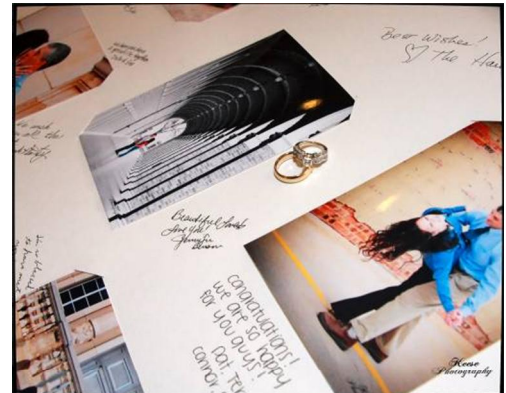
The reception immediately followed in the Ballroom of the Hilton Midland Plaza