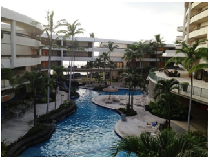
Our hotel view from the front balcony