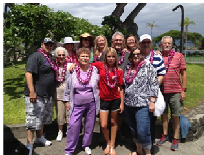
Airport (arrival in Hawaii)