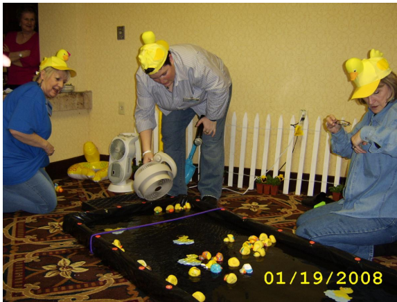
Duck Race Officials

The theme will be Spring Flowers and Leadership in the 21 st Century.