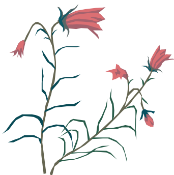
BPW in Bloom

These Young ladies are with the ROTC at Texas A & M. They proudly represented the Core by presenting the colors at the Mid Year Board.