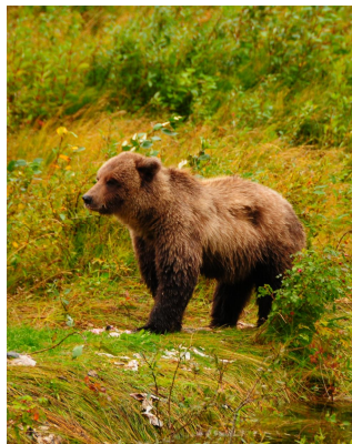
Grizzly bear dining on salmon