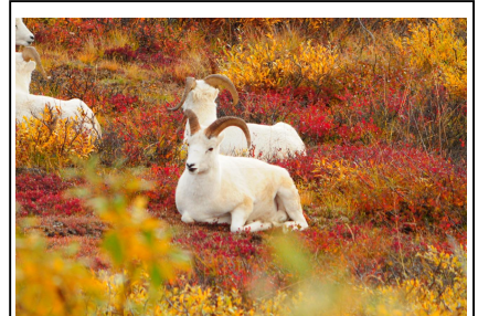
Dall sheep enjoying fall in Denali National Park