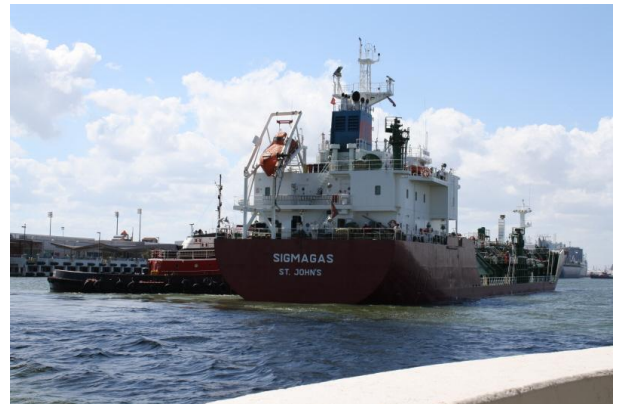
Pilot boat turning a ship for docking