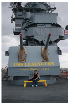
Me on deck