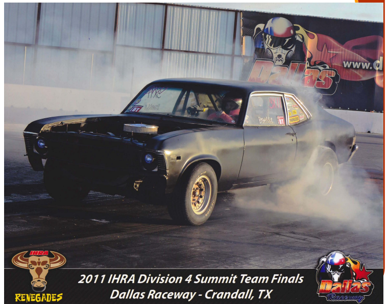
2011 IHRA Division 4 Summit Team Finals Dallas Raceway - Crandall, TX