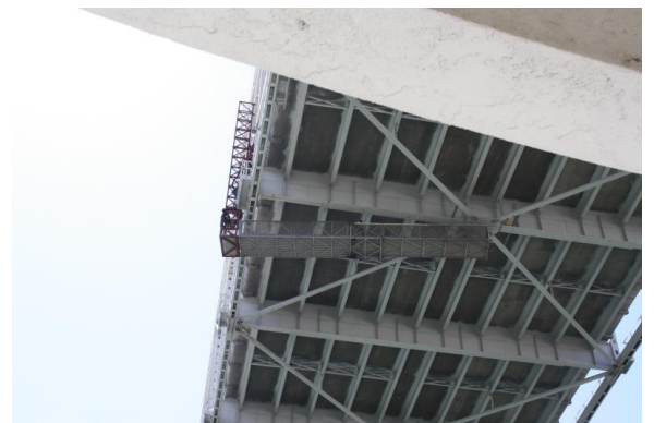
2 workers making repairs on the underside of the ship channel bridge in Corpus Christi Bay