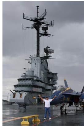
Smitty on deck