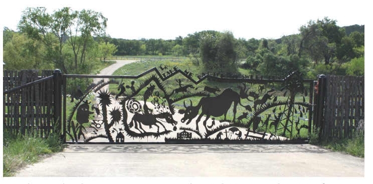
Take me back to my sweet texas homeô (across the top of gate)

Below is photo taken on vacation this spring. The gate is on Willow City Loop north of Fredericksburg.