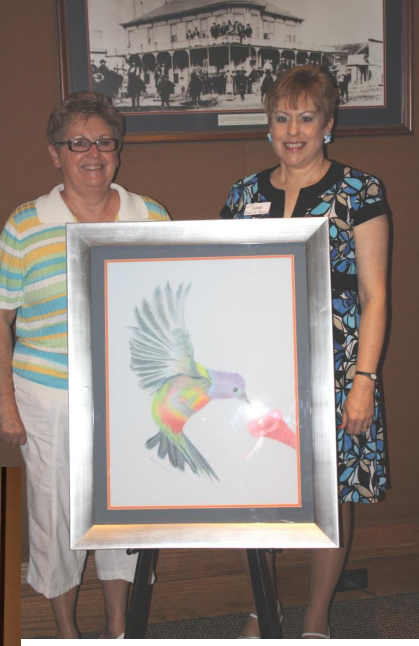
actor, artist and entrepreneur extraordinaire