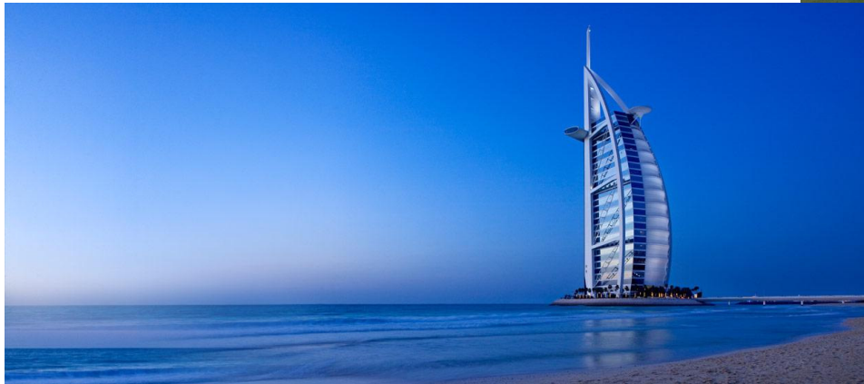
Taken on our way out to eat at Burj Al Arab