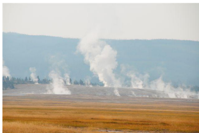
Valley of Steam

Every once in a while we would park and take a short hike to see pretty paint pots, gurgling mud pots, or cascading travertines (somewhat like cavern formations). One day was spent in Lamar Valley where we saw, of course, more buffalo herds, and one stampede just like in the movies only no Indians! A nice big gray wolf sauntered thru and crossed the road for us there. We got desperate to see a bear, though, and had to visit a Discovery Center to see them. One was having so much fun in his swimming pool; you would have thought it was a teenager in a bear suit! Nights were spent