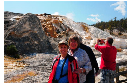
Travertines (above) Beautiful Days End.