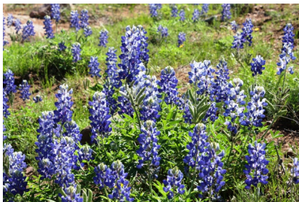
Some bluebonnets Art Hedwig Hill Road, Mason

Monday, we drove the Willow City Loop (north of Fredericksburg) and enjoyed the flowers and visiting with other flower seekers all out snapping photos!