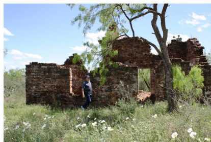
An old abandoned building