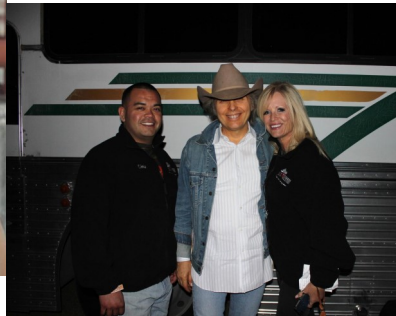
Dwight Yokum and Kris