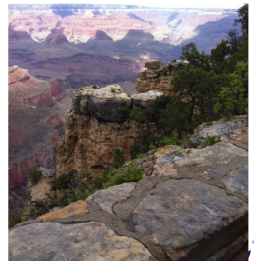
Looking out at the Grand Canyon! That is a HUGE hole!! It was raining across the canyon. Pretty cool!