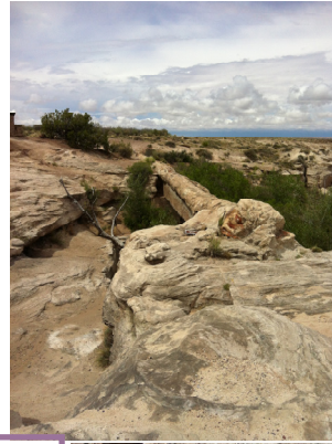
Agate Bridge— Fossilized Tree Bridge —Petrified Forest