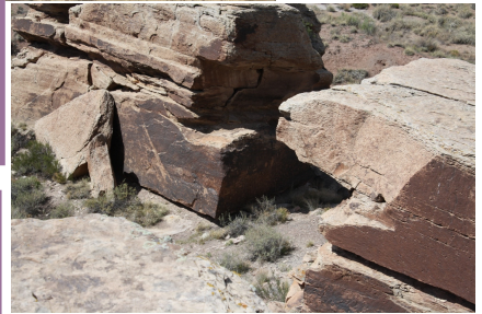
and then down to Silver City NM and the Gila Cliff Dwellings and the longest constantly mined open pit copper mine in the U.S. and the City of Rocks. Then on Saturday the 21st we loaded up and headed back to Midland. Great trip!! Even better visiting with family!