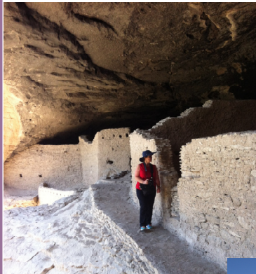
Me checking out the Gila Cliff Dwelling North of Silver City NM. The path had several switchbacks and steep steps to get up to the dwellings! Well worth the walk.