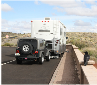
Fattest crows we have ever seen!!