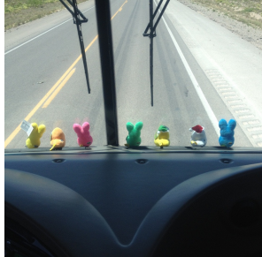
Guide Peeps showing the way!! (sitting on the dash of our motorhome..)