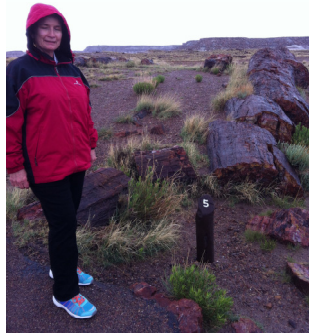
Me at the Petrified Forest (first stop)