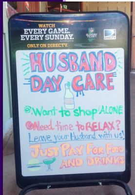
Sign outside a Shop at Sedona