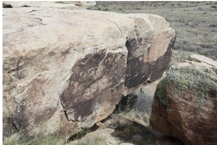
One of multiple rocks with petroglyphs on them at Rio Puerco Village