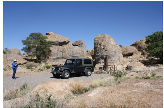
Hundreds of Rocks jut up out of the ground