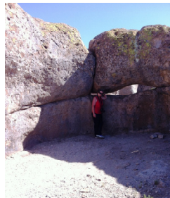
Below Me at City of Rocks