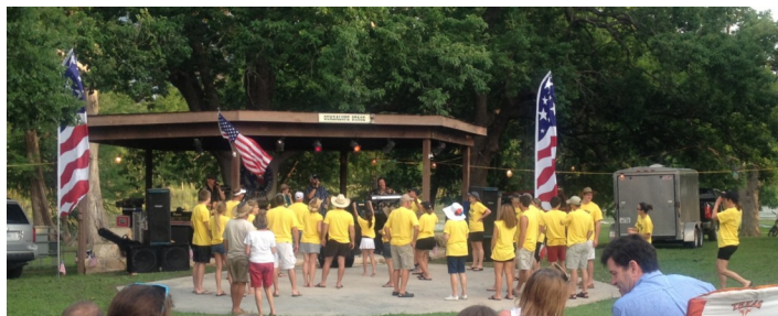
Band and the Texas Trailer Trash in yellow t-shirts dancing

It was good to get away for a week and relax.