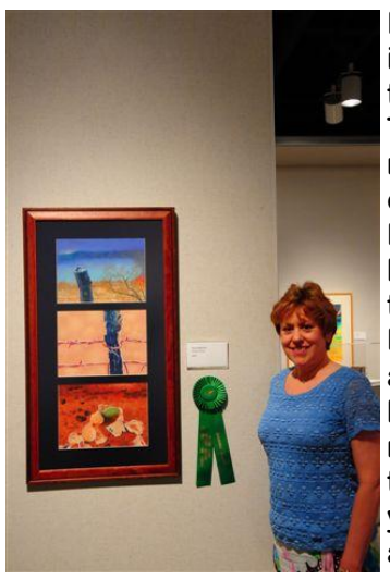
I was VERY excited to get two of my latest works accepted into the Odessa Art Associations juried show this spring at the Ellen Noel Museum in Odessa.

There were about 200 entries, but only 87 were chosen and most of them were from career artists who had lots more experience than me! Opening reception and awards was Friday, May 18th. When I arrived, I found my "Krug Sugarbush" picture with a big green ribbon beside it. Then, I turned around and there was my Fire picture, "It Lives! It Lives!", with a green ribbon, too!!! I was so overwhelmed, I