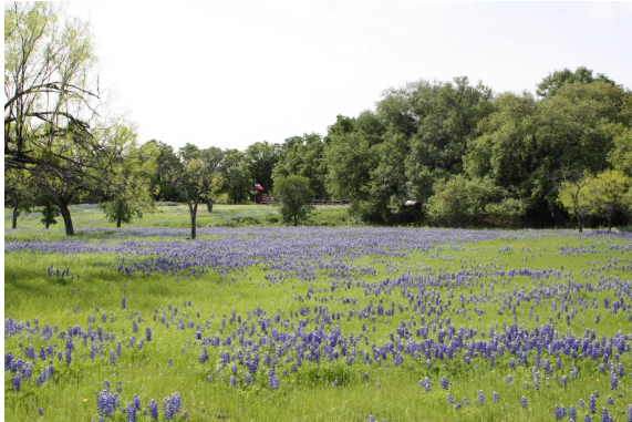
041210 Texas Flag flying in the field of wildflowers on Willow City Loop

Below are two more wildflowers from our April trip to Mason and Fredericksburg and Willow City Loop sight seeing trip.