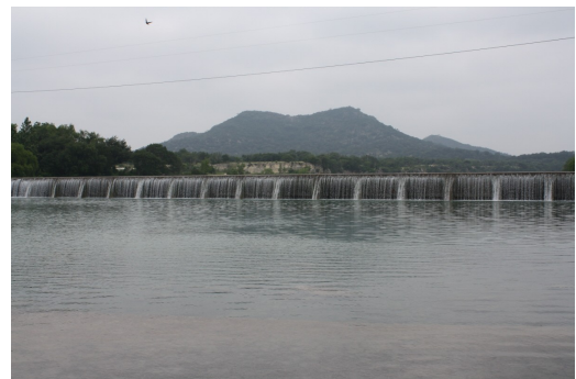
Spillway on the Nueces Lake at Cooksey RV Park