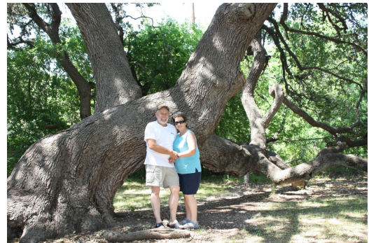
Standing in front of one of the huge multi-branched trees