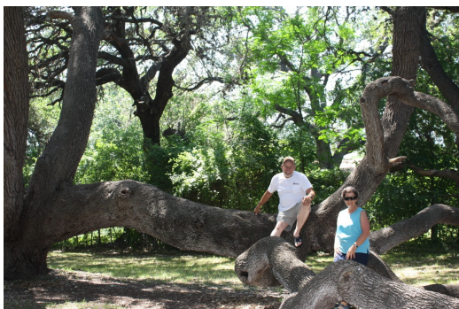
Sitting on one of the large branches on the tree