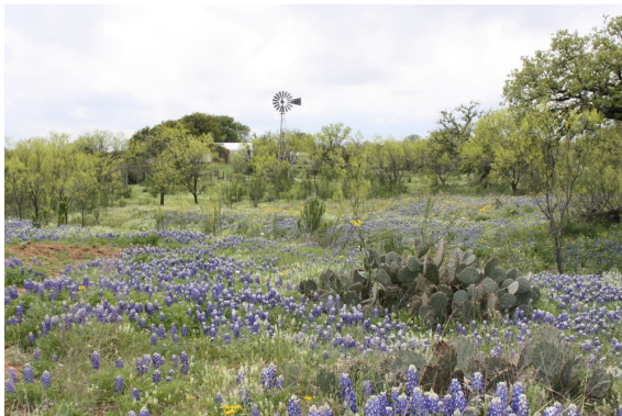
041110 Windmill and wild flowers on Art Hedwig Road outside of Mason

Hello to All!!! Hope you are having fun!