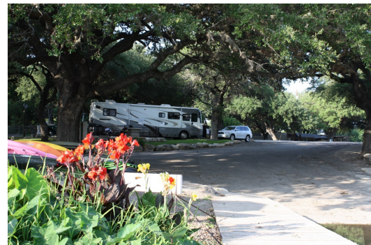
Parked under the huge trees

We finally got out of town. Early June we loaded up the motor home and travelled to Camp Wood. Smitty and I stayed at Cooksey RV Park just south of there. It is a county park along the banks of the Nueces River. The trees were huge and the shade was plentiful. Lots of fun in the sun and water!