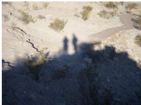
(see shadows of 2 fossils)