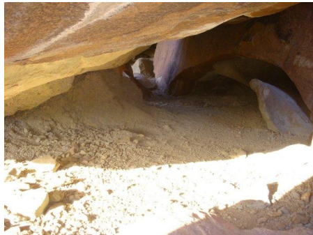
Indian Head Mountain Rock