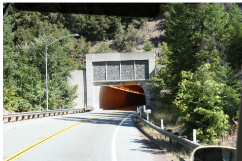
Randolph Collier Tunnel—shortly after crossing into Oregon Falls.

A nice couple we met at the rest area before you enter the Randolph Collier Tunnel. He had restored the pickup and had it painted to match their vintage travel trailer.