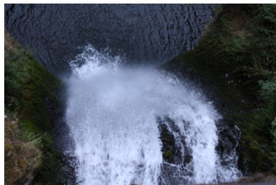
Looking down at the top of Multnomah Falls

On 9/18 we got up and left Oregon heading back to Texas. We stopped to fuel the motorhome and retrieve the gas cap for the jeep (we had fueled it the night before and discovered when hooking up to leave that we did not have the gas cap). Oregon does not allow you to pump your own fuel. Must be a jobs deal or something. Very strange.