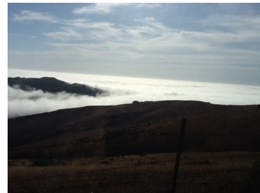
Fog rolling off the ocean and into the mountains