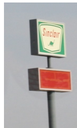
Sinclair Gas - WY

We made it home on Thurs. Sep 20th. Hard drive but we decided we were ready to sleep in our bed at the house. Great trip and wonderful sights.