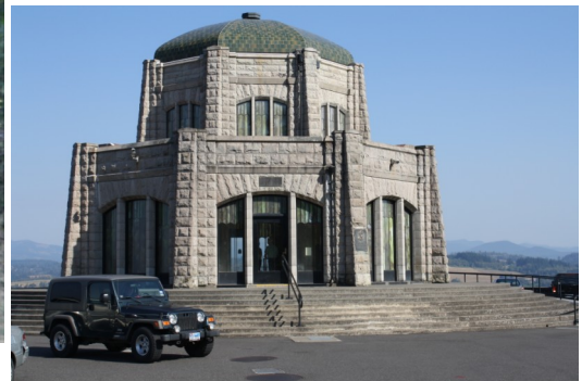
Vista House built in 1916 overlooking the Columbia River Gorge. Beautiful building and beautiful scenery