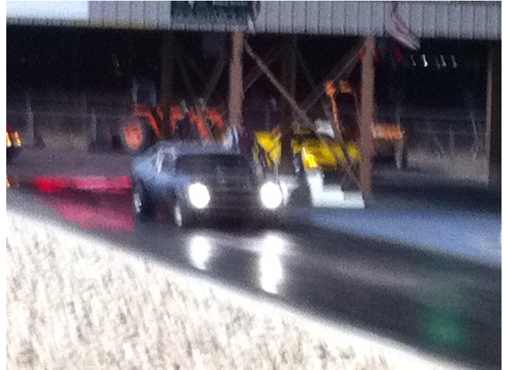
Way to go Bronna - Congrats!!