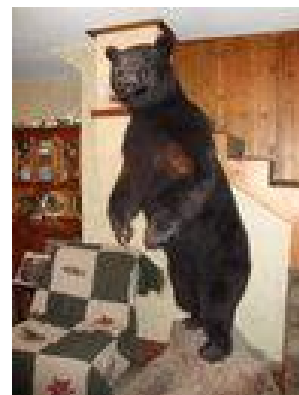
The welcoming committee chair, in the main lodge

We had a great time at the lodge. The weather was good, the grounds were all nice and green, the food was good, but the company was the best. It was the first reunion we have had in years, and it turned out wonderful. No fist fights or nothing!!!!!!