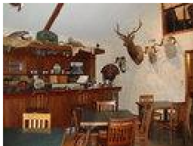
A trophy room