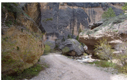
Crazy Woman Canyon- Wyoming Above and Right