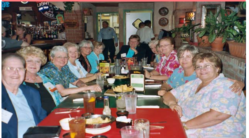
Region 6 ladies at State Convention